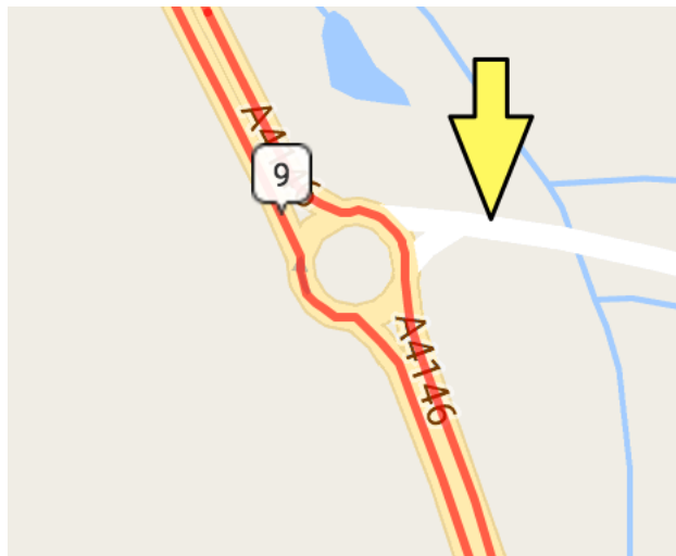
RAB 3 (passed twice)