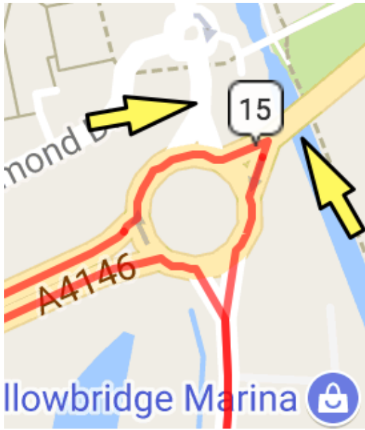
RAB 1 (passed twice)