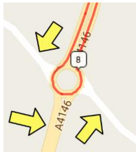
RAB 4 – turn (passed once)

* The principles used for determining sign placement are as follows: