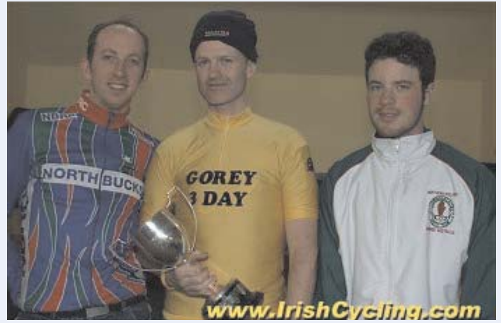
The Gorey Podium Three